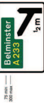
2101.1 Grade separated junction ahead of a non-primary route and a primary route